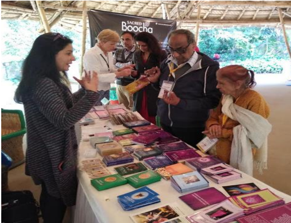
Several new seekers came from different cities from north and south India.