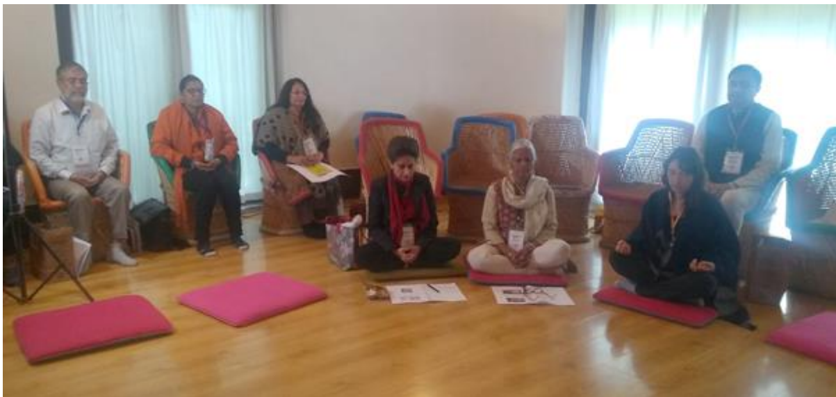
On the following Sunday, March 10, we hosted another full-day workshop, “ Secrets of Attracting Money and Cosmic Abundance ” at a well-known venue in Delhi, the India Habitat Center . This topic is very popular in India. The bookstall gathering and sales at both workshop venues were very encouraging.