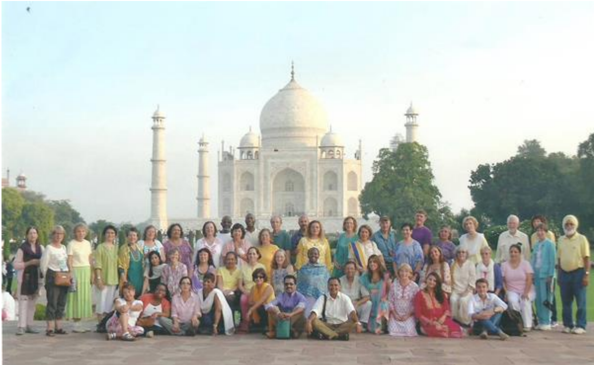
Pilgrimage at the Taj Mahal in 2015

During the previous four India pilgrimages conducted by the Chananda Cultural Society in 2009, 2011, 2013 and 2015, the pilgrims who participated came from various countries across the world. One of the purposes of these pilgrimages has been to do spiritual work for clearing the cities visited and the populace of prevailing records of negative energies. According to the teachings of the ascended masters, this ritual allows people to receive the light of their own Mighty I AM Presence.