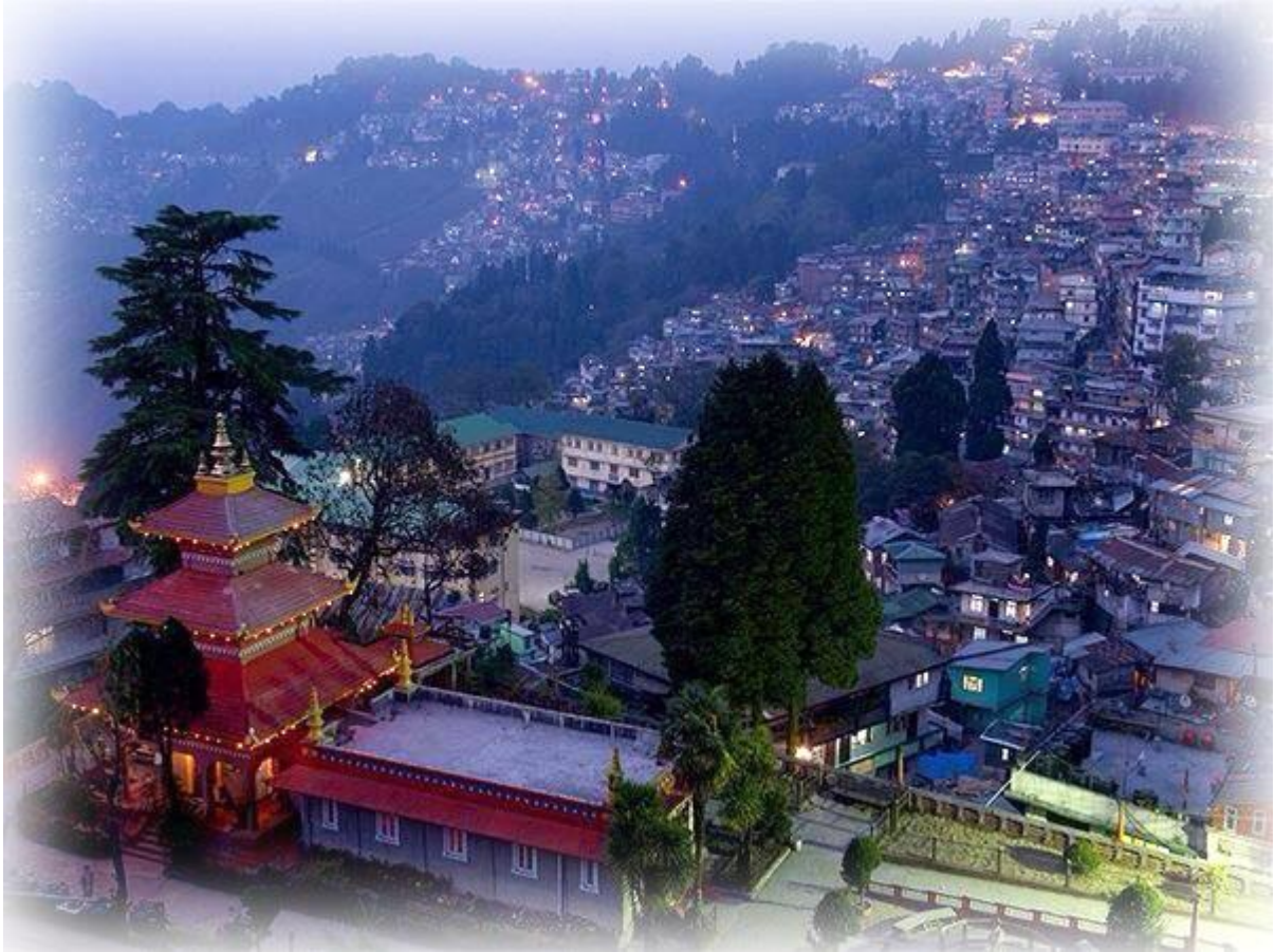
Darjeeling lights at night

The trip is being planned in mid-September 2022 when the weather is very suitable.