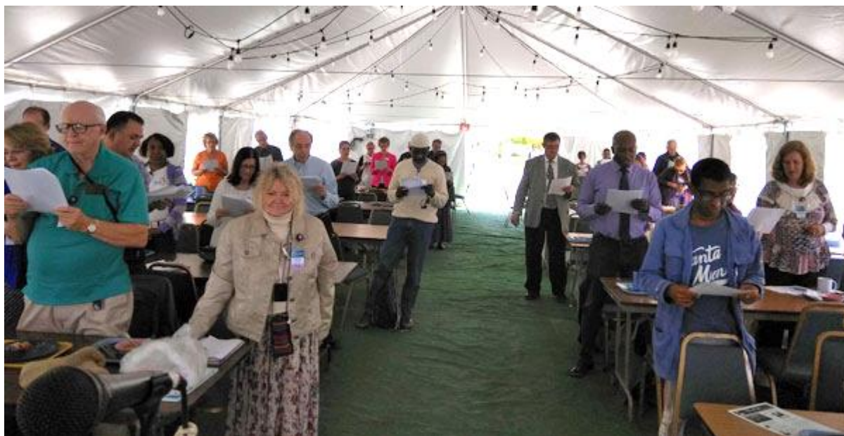
India meeting at the 2018 Freedom conference

Every year India update meetings are held during the summer conferences at the Inner Retreat to debrief the community of our ongoing progress in outreach initiatives and learn new ideas through group interactions.